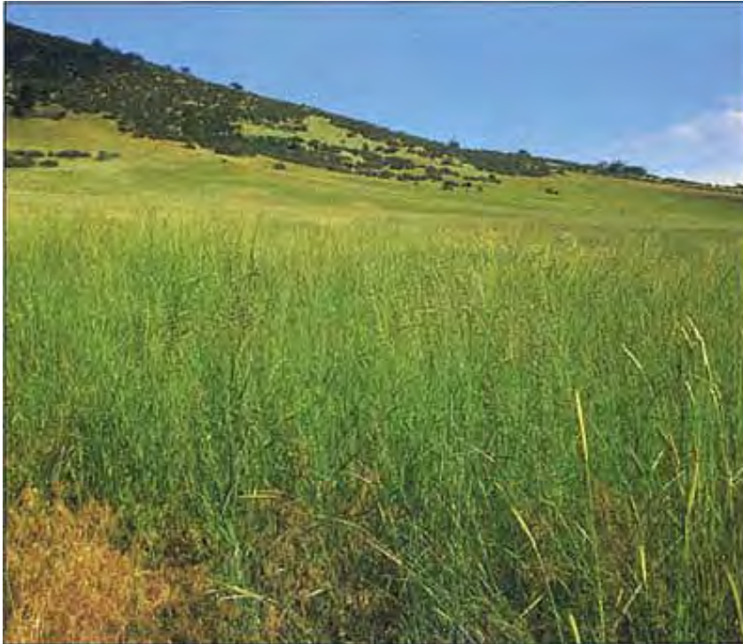
Figure 1. Pubescent wheatgrass pasture.