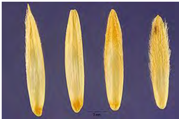
Figure 2. Pubescent wheatgrass seed.

For maximum forage production, pubescent wheatgrass should be planted in a mixture with a legume to obtain higher yield. It has enough seedling vigor to either be planted in the same row with the legume or in alternate rows (i.e., grass, alfalfa, grass, alfalfa). Row spacing is recommended at 12 to 18 inches under irrigation and 18 to 24 inches under dryland conditions. When planted with a legume, harvest hay at the optimum stage for the legume (i.e., no more than 10% bloom). This will allow the grass to be harvested prior to flowering and result in very high quality hay.