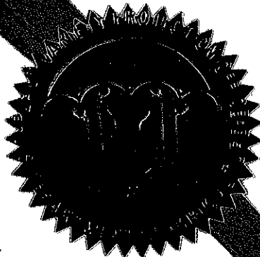
Secretary of Agriculture